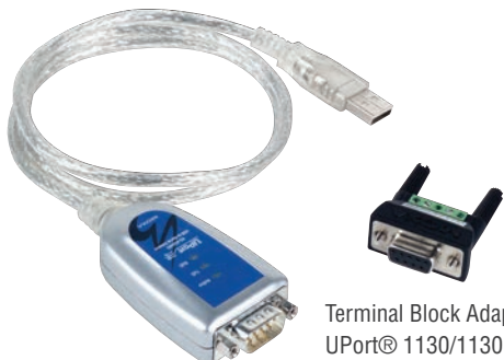
Terminal Block Adaptor for UPort® 1130I/1130I/1150