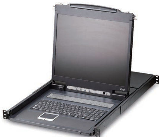
CL1316 Front view