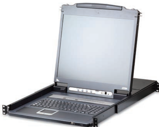
CL5716I Front View